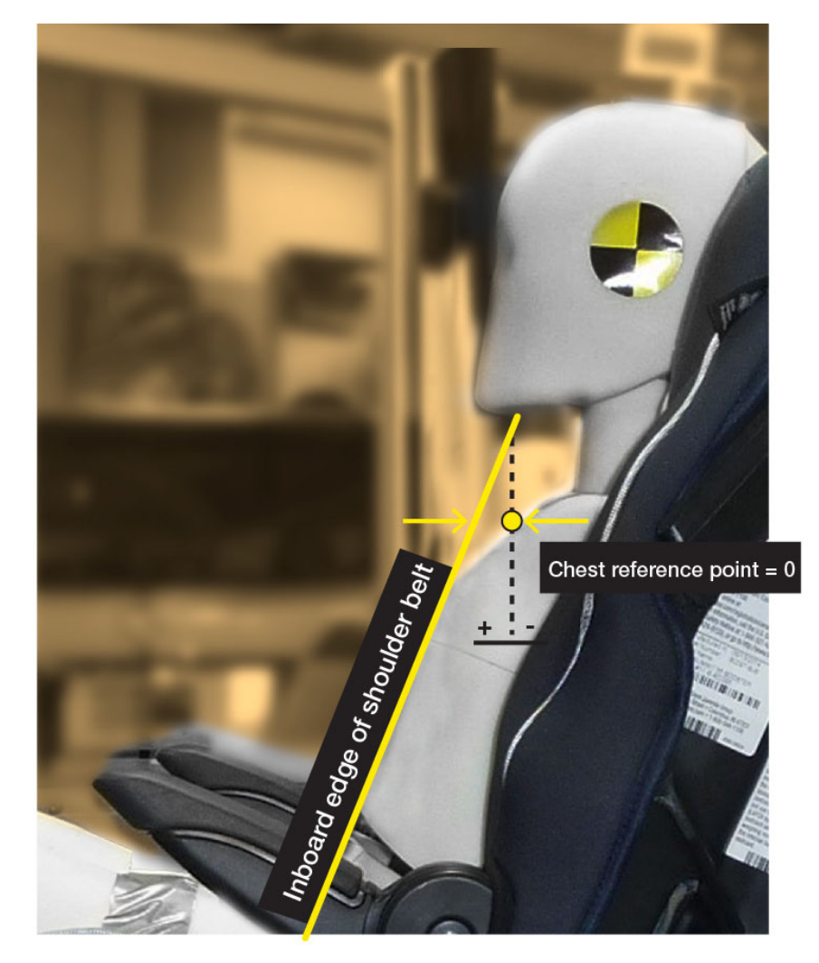
Figure 3. Fore/Aft Distance from the Chest Reference Point to the Inboard Edge of the Shoulder Belt

The shoulder belt must be in a good position both laterally, as measured by the shoulder belt score, and longitudinally, to adequately restrain the child in a frontal crash. The shoulder belt must lie across the chest, such that the shoulder belt fore-aft distance from the chest reference point to the inboard edge of the shoulder belt is less than 10 mm (Figure 3).