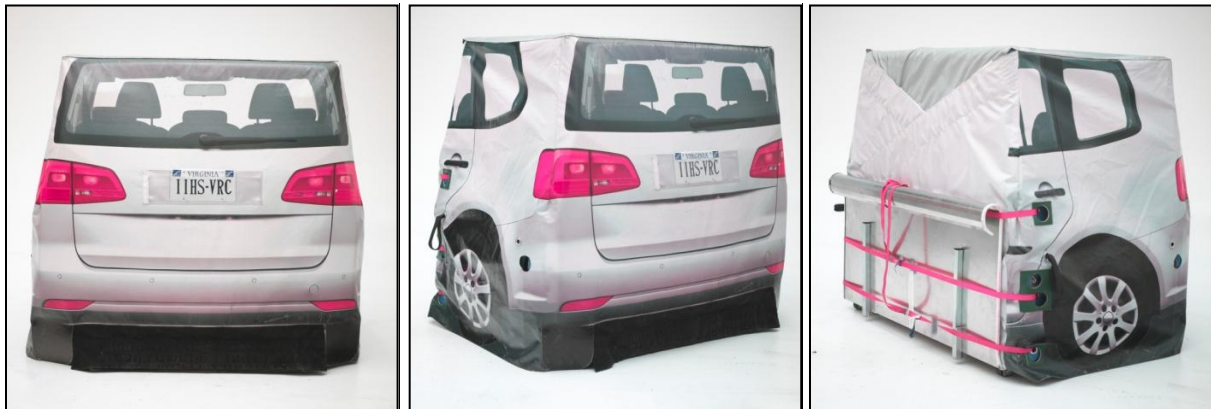
ADAC Advanced Emergency Braking System Stationary Target