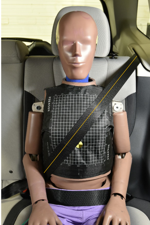
Figure 3B. Natural shoulder belt position