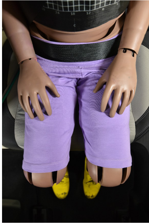
Figure 4 Hand placement for dummies with full arms