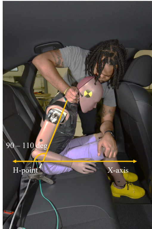
Figure 1 Example of torso rotation