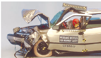
1995 SAAB 900 Poor structural performance: major intrusion into the occupant compartment