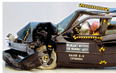
1999 SAAB 9-3 Improved structural performance: somewhat less intrusion