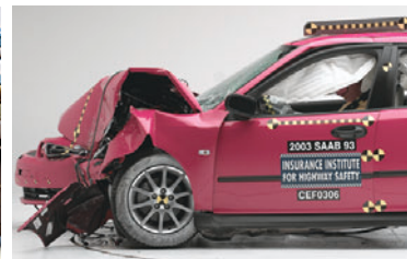
2003 SAAB 9-3 Good structural performance: much less intrusion

was somewhat improved, but there were still structural problems. In contrast, the new 2003 9-3 is a good performer and a best pick. The structural design of this car is much improved compared with its predecessor models."