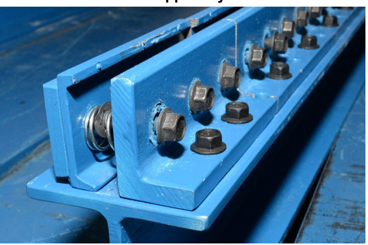
Figure 2 Rocker Panel Support System – Detail