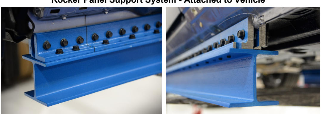
Figure 1 Rocker Panel Support System - Attached to Vehicle

Prior to testing, the front-row seat back on the side being tested is reclined to prevent interaction with the crushing roof. Rear seats are latched in their upright position. All windows are closed and doors are locked.