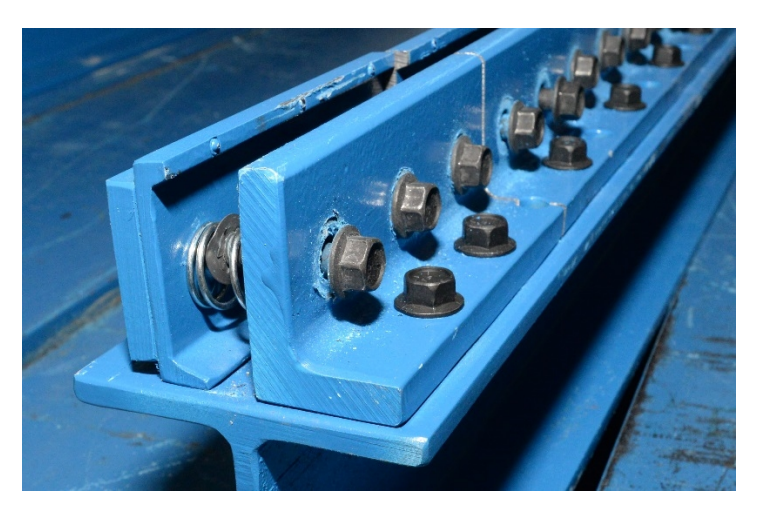
Figure Rocker Panel Support System – Detail