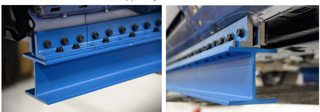
Figure 1 Rocker Panel Support System - Attached to Vehicle

Prior to testing, the front row seat back on the side being tested is reclined to prevent interaction with the crushing roof. Rear seats are latched in their upright position. All windows are closed and doors are locked.