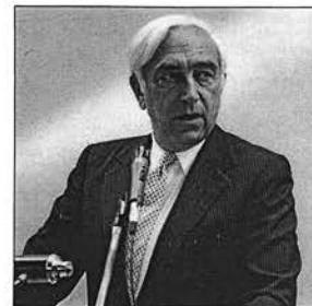
Lautenberg: There can be a profound effect.

Sen. Jack Danforth, Missouri Republican, talked of the tragic experience of his niece who was hit by a car nine years ago. A high school senior, she had just been accepted by St. Lawrence University. She lay in a coma for a month