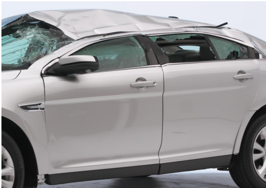
Figure 1. 2010 Ford Taurus after IIHS roof crush test to 254 mm, showing performance of laminated glazing (front window) and tempered glazing (rear window)