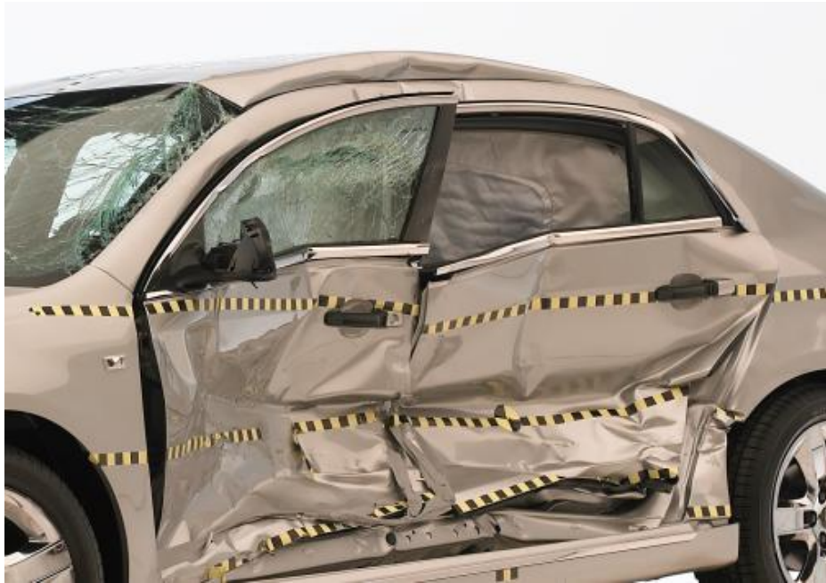
Figure 2. 2008 Chevrolet Malibu after IIHS side impact test, showing performance of laminated glazing (front window) and tempered glazing (rear window)