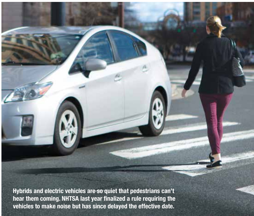
Hybrids and electric vehicles are so quiet that pedestrians can’t hear them coming. NHTSA last year finalized a rule requiring the vehicles to make noise but has since delayed the effective date.

IIHS supported the requirement. A 2011 HLDI analysis found that hybrids were about 20 percent more likely to have a bodily injury liability claim without an associated claim for vehicle damage than their conventional counterparts. Such claims are likely to result from pedestrian crashes (see Status Report , Nov. 17, 2011). ■