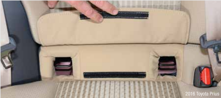
2016 Toyota Prius

The Toyota Sienna’s anchors are at the very bottom of the seatback, near a lot of potentially confusing hardware. In the 2015 model (left), the problem was compounded by the lack of a clear label. In the 2016 Sienna (right), the tether anchors are in the same spot, but a new label makes them more obvious.