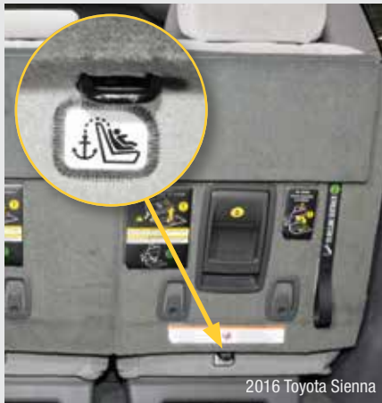
2016 Toyota Sienna

The Toyota Sienna’s anchors are at the very bottom of the seatback, near a lot of potentially confusing hardware. In the 2015 model (left), the problem was compounded by the lack of a clear label. In the 2016 Sienna (right), the tether anchors are in the same spot, but a new label makes them more obvious.