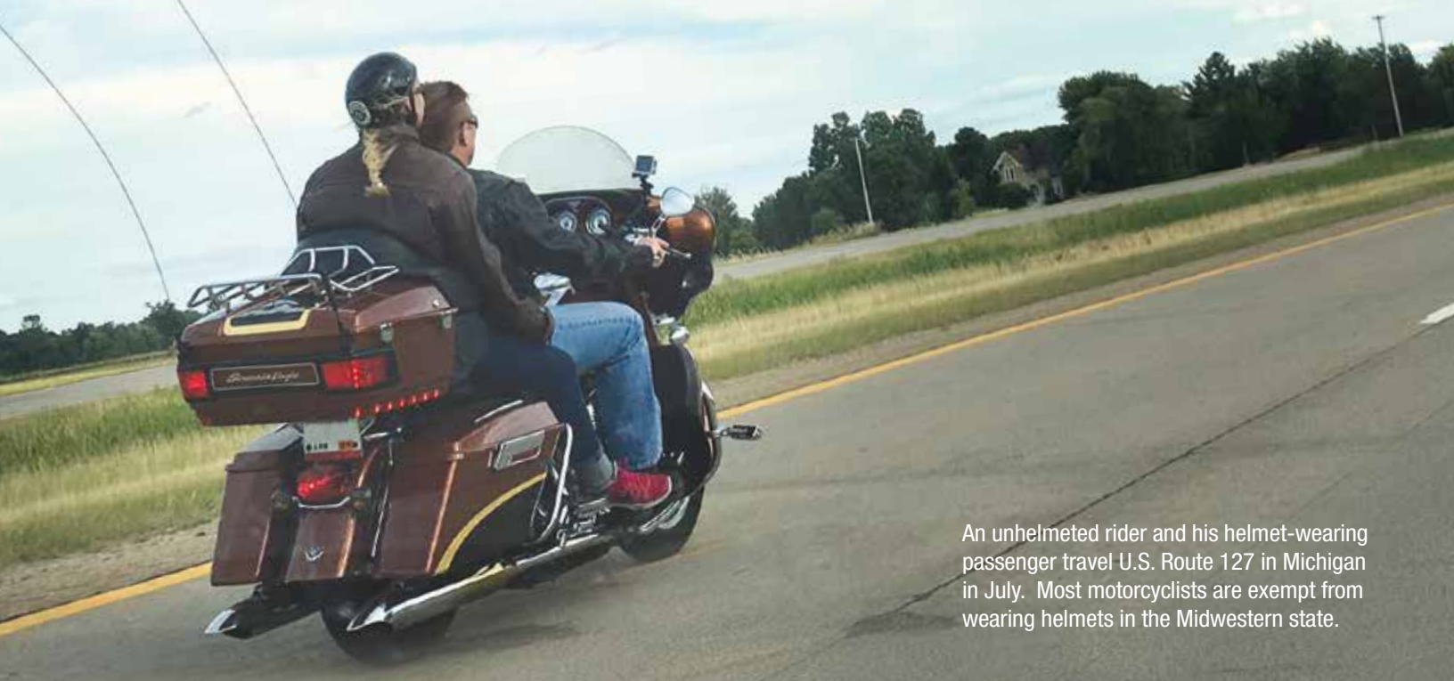
An unhelmeted rider and his helmet-wearing passenger travel U.S. Route 127 in Michigan in July. Most motorcyclists are exempt from wearing helmets in the Midwestern state.