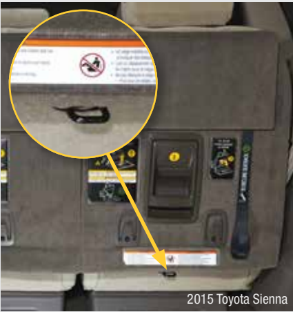
2015 Toyota Sienna

“You can imagine that as an adult riding in that seat, if you feel a wire poking you in the back on even a short trip, it’s going to make you fairly upset with your vehicle,” Pelky says. “Of course, we put a great deal of effort into making sure our efforts meet the needs of our smallest passengers, our children, but we also need to keep those adults comfortable as well.” ■