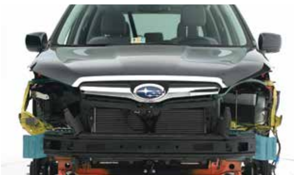
Symmetrical appearance, marginal passenger-side performance