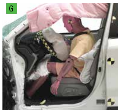
Driver-side small overlap test