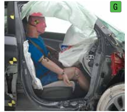
Passenger-side small overlap test