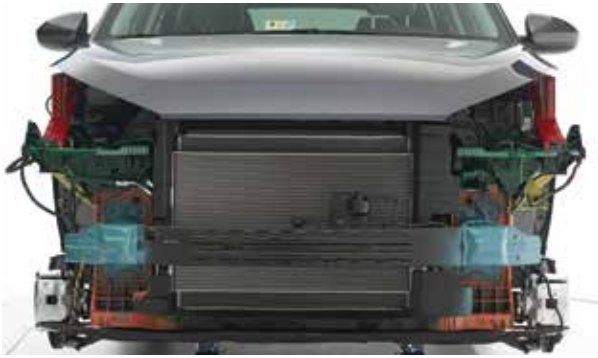
Symmetrical appearance, similar performance