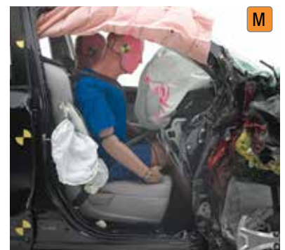
Passenger-side small overlap test