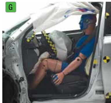
Driver-side small overlap test