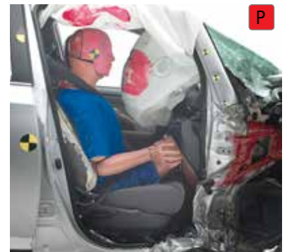
Passenger-side small overlap test