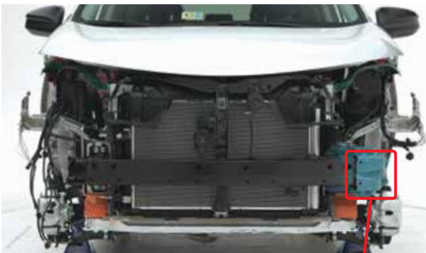
Asymmetrical appearance, poor passenger-side performance