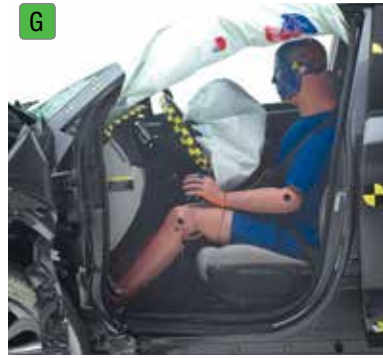
Driver-side small overlap test