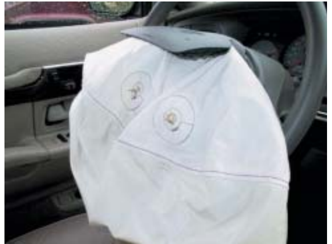
The driver airbags in these 1998 and 1999 models with depowered airbags offered equivalent or improved occupant protection, compared with 1997 models manufactured before NHTSA changed the rules to allow depowering.