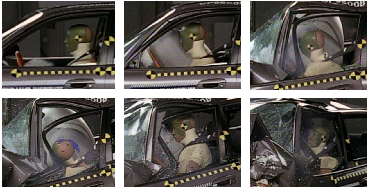
Figure 6. An example of poor performance, the 1995 Mitsubishi Galant (CF95008). The dummy rotated around the left side of the airbag. Its left shoulder hit a sharp edge of the buckling window frame, which could cause lacerations, and its head hit the window frame.