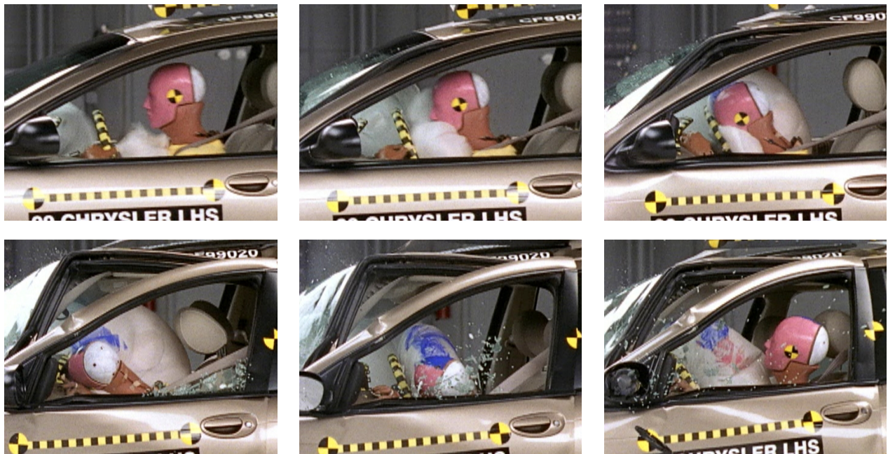
Figure 7. Another example of poor performance, the 1999 Chrysler LHS (CF99020). The airbag deployed too late, allowing the dummy's head hit the steering wheel directly.