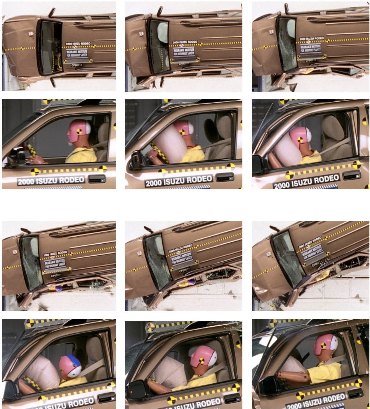
Figure 5. An example of marginal performance, the 2000 Isuzu Rodeo (CF00014). During rebound from the airbag, the dummy moved toward the driver door. Its head leaned through the open side window and approached but did not contact the window sill. In combination with sufficient rotation of the upper torso for the head to face nearly upward, this motion lowered the rating to marginal.