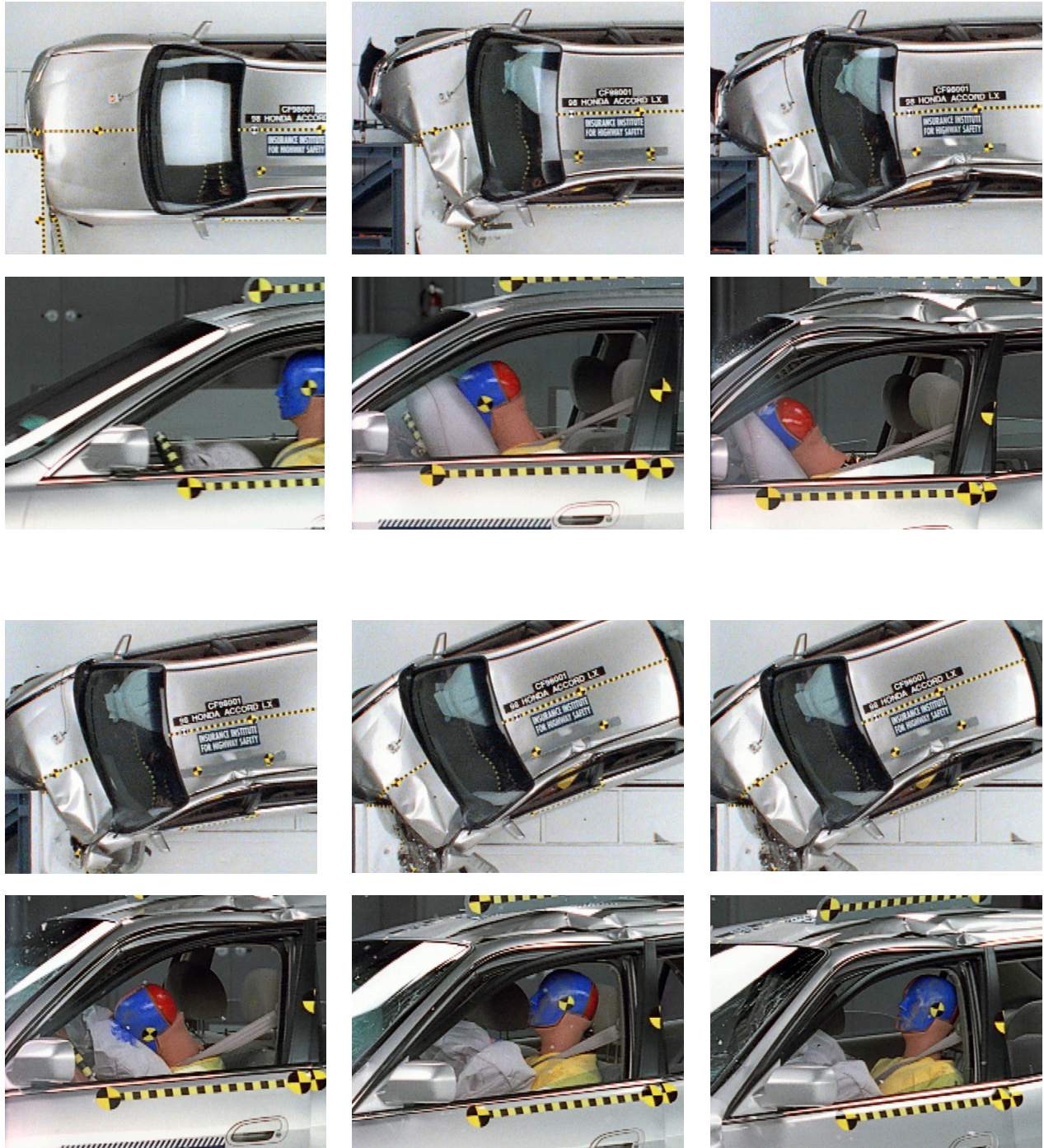
Figure 2. Another example of good performance, the 1998 Honda Accord (CF98001). As in the 2000 Chevrolet Impala, dummy movement was well controlled. After moving forward into the airbag, the dummy rebounded into the seat without its head coming close to any stiff structure that could cause injury.