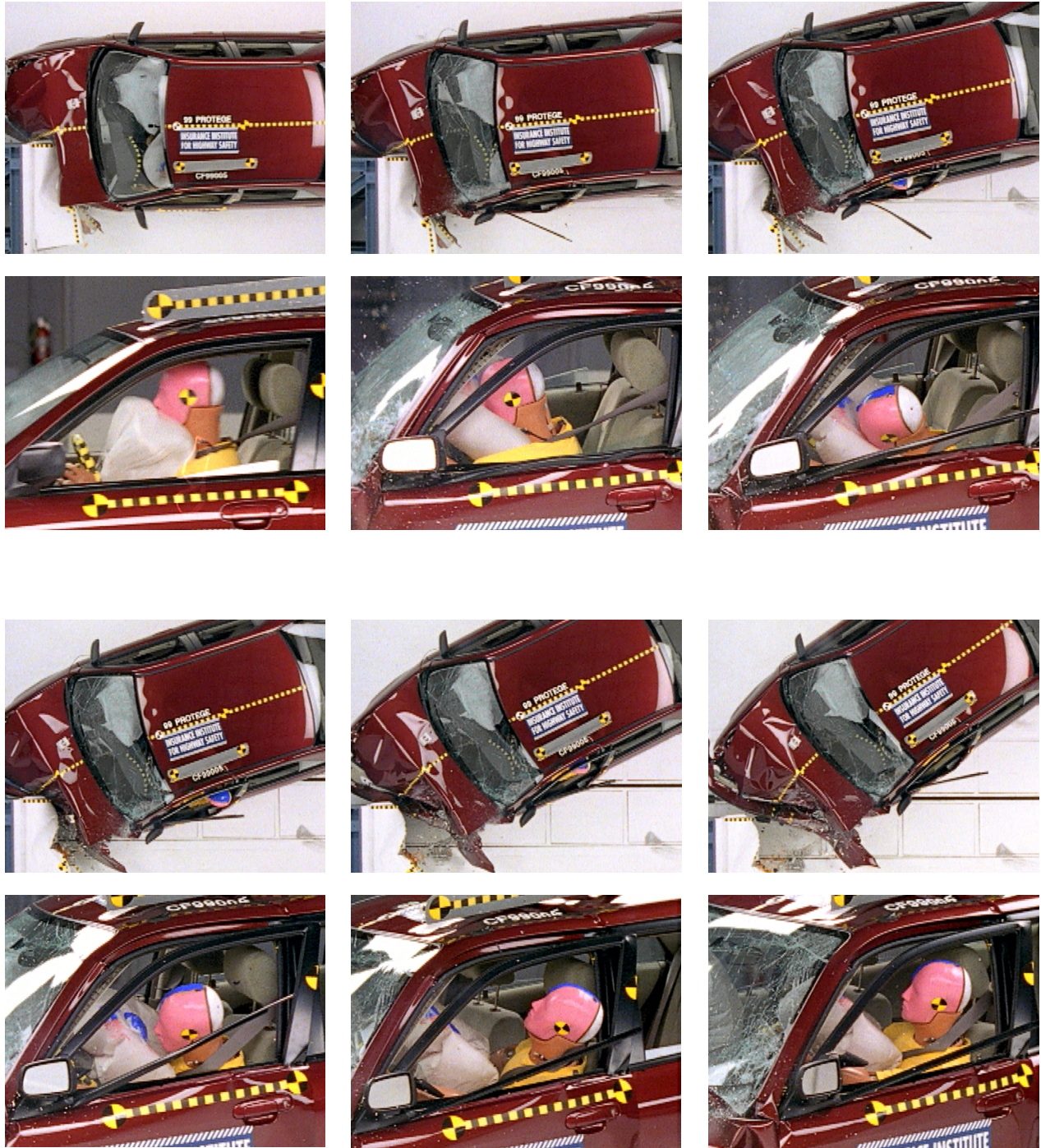
Figure 4. An example of acceptable performance, the 1999 Mazda Protege (CF99005). After the dummy moved forward into the airbag, it moved toward the driver door,. The dummy's head moved through the plane of the side window during rebound, lowering the rating to acceptable.