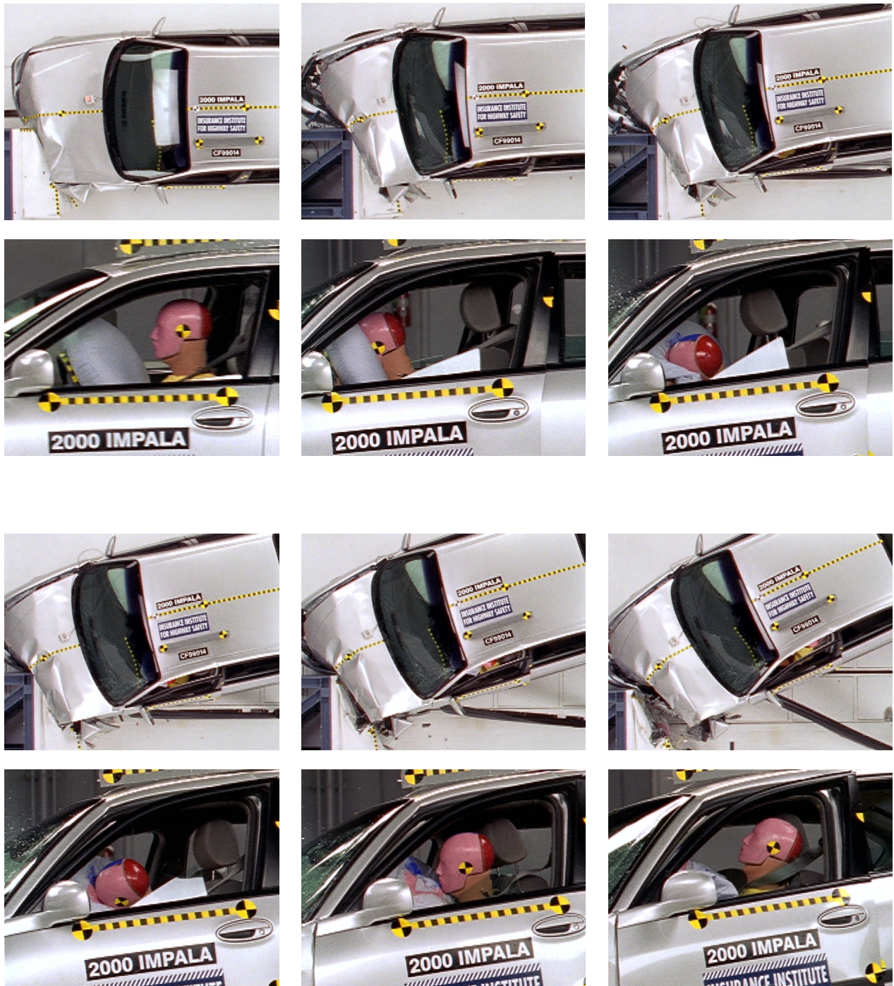
Figure 1. An example of good performance, the 2000 Chevrolet Impala (CF99014). Dummy movement was well controlled. After the dummy moved forward into the airbag, it rebounded into the seat without its head coming close to any stiff structure that could cause injury; the dummy's head contacted only the head restraint.